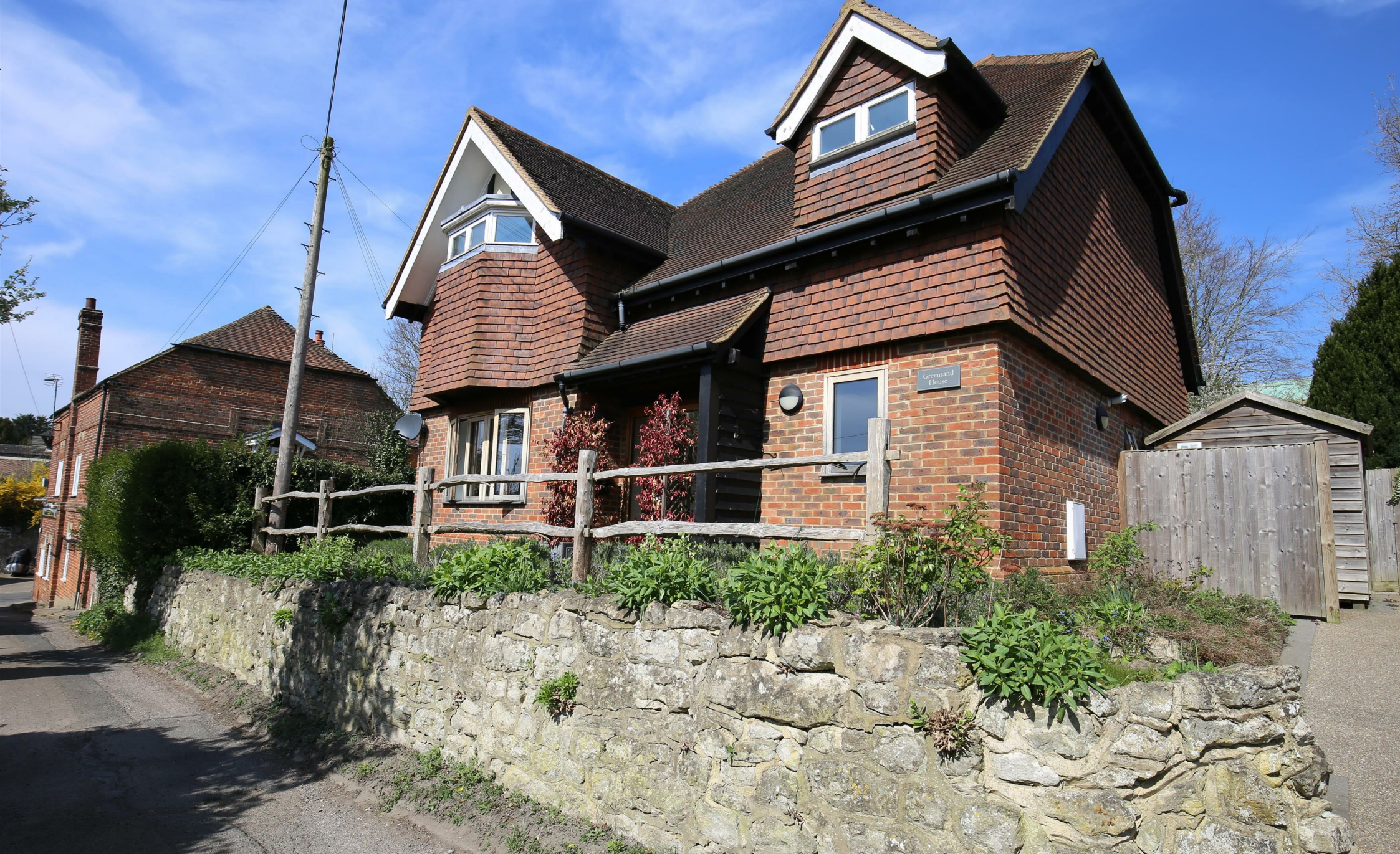
Greensand House School Lane, Sutton Valence, ME17 3HH £2,500